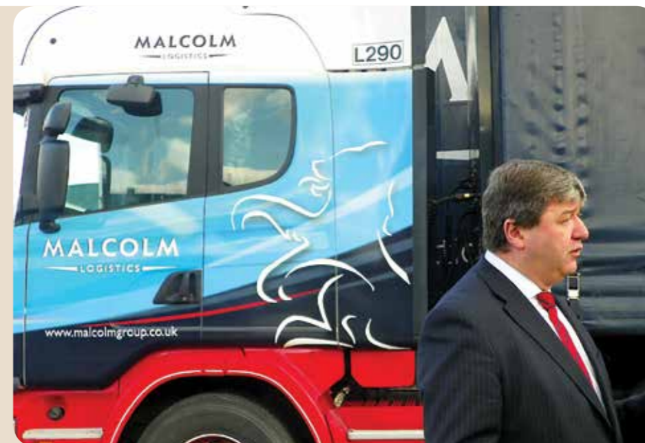
Alistair Carmichael, Secretary of State for Scotland, pictured being interviewed at Malcolm Logistics' Grangemouth depot.

to visit the Malcolm Group's site in Grangemouth. Touring the impressive facility emphasised to me how the resources and labour force available in and around Grangemouth are playing a key role in helping the Malcolm Group fulfil their ambition." He then went on to say, "The Malcolm Group's expansion across the country over the past 60 years shows that they are making the most of the opportunities that the