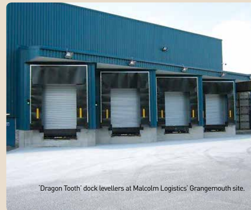
'Dragon Tooth' dock levellers at Malcom Logistics' Grangemouth site.

This was followed by essential maintenance works to the yard at Malcom Logistics' Head Office in Linwood, as well as the replacement of dock curtains.