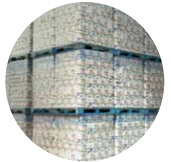
Cased Goods Blocked