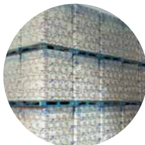
Cased Goods Blocked