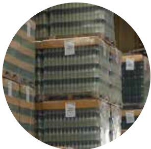
Palletised Glass Bottles