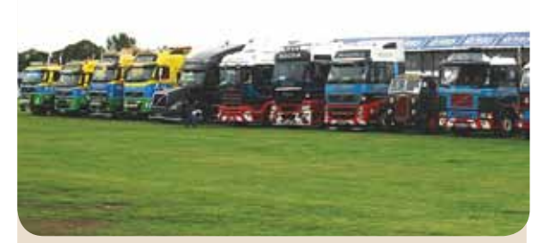
Malcolm vehicles take the arena at Truckfest Scotland.

The Malcolm Group once again led an impressive display of trucks to both Truckfest Peterborough and Truckfest Scotland.