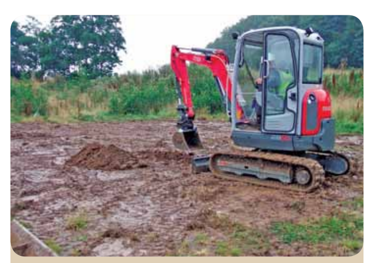
Operating the machine is Nicky Rea.