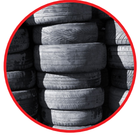
Recycled tyre casings