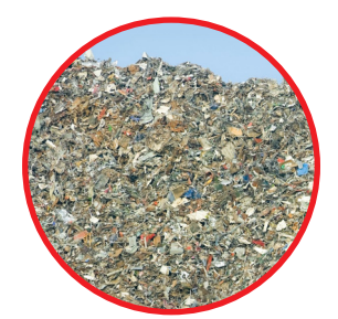
Commingled mixed waste