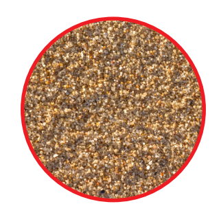
Silica sand (to the Glass Industry)