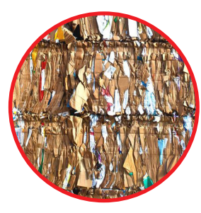
Reclaimed Paper (RCP)