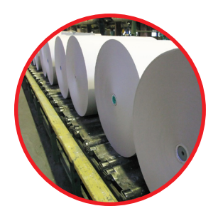
Paper reels (to the Print Industry)