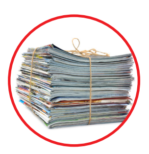
Magazines (recovered from the Publishing Industry)