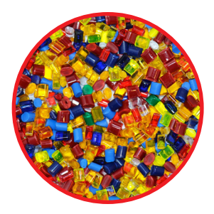
Recovered plastics (loose & baled)