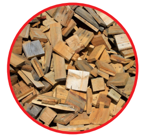
Multiple grades of waste wood (RCF)