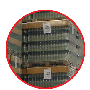
Palletised glass bottles (Beverage Industry)