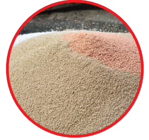
Compost based products