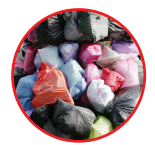
Supermarket Waste by-products (to anaerobic digestion plants)